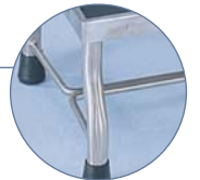
H-Brace offers extra reinforcement.