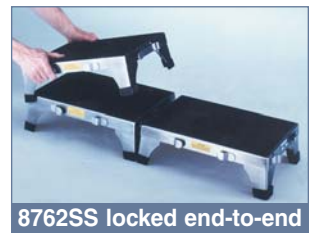
8762SS locked end-to-end

Add the optional dolly 8762SS-D for easy transportability.